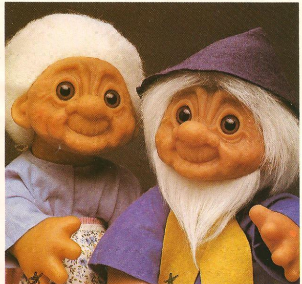
700 14 1/8" Here's Grandma and Grandpa. Of course they miss the old country, but they wanted to be as close to the little ones as possible. You'll love their crinkly, wrinkly faces, and they'll babysit for you in a pinch. Moveable H, A&L. (L-R 7001, 7002)