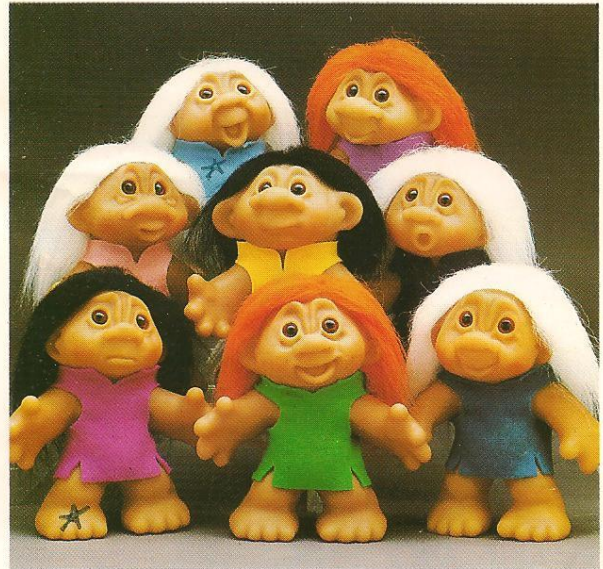
520 5 1/8" These funny faces are terrific if you want to start a cheerleading team. Kirsten and Litten (bottom two on right) are sure to be asked out first by every quarterback in the area. Available only in half-dozen mixes.