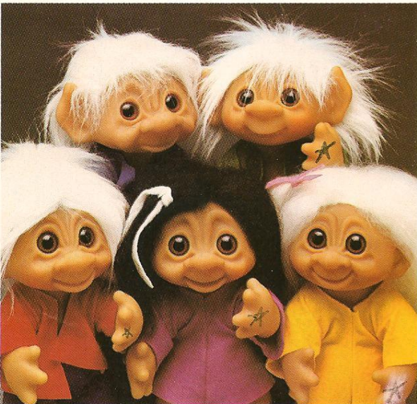
604 9 3/4" Watch out for the two fellows up top—the mischievous ones in the bunch. They love to pull their sisters' hair and steal their cakes and cookies when no one's looking. Moveable head and arm. (Top row L-R 6041, 6042.) Bottom row L-R 6043, 6044, 6045, 6046, a thumbsucker, refused to have her picture taken.)