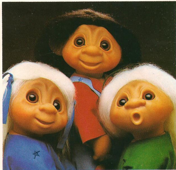
806 18" As you can see, this happy threesome has a theatrical streak. They love to act and sing and dance, but sometimes, when things get rough, the little miss on the right sucks her thumb for consolation. Moveable H, A&L. (L-R 8061, 8062, 8063)