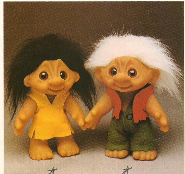
603 7 1/2" Hilda and Thor love the movies. You needn't buy them a seat, though: at 7 1/2" they can easily fit into a carton of popcorn if you'll only take them along. He loves Star Wars . She loves Lady and the Tramp . (L-R 6031, 6032)