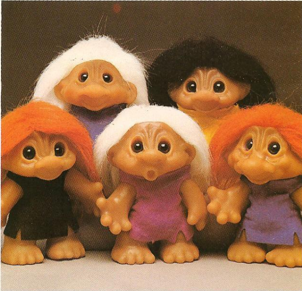
520 5 1/8" Brigitte, Astrid, Olga, Liv and Lerne are inseparable and often take long walks down by the river discussing philosophy and fashion. These little sisters are available only in half-dozen mixes.

They're not just adorable, they're smart, too.