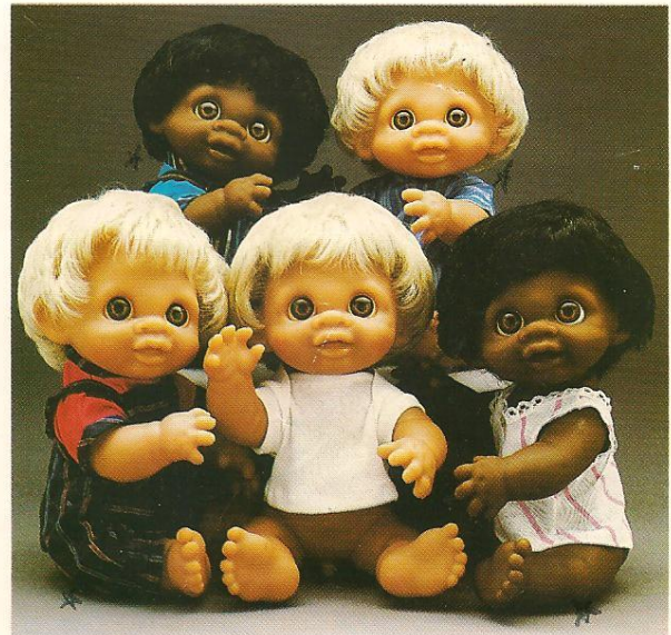
330 11 1/2" For today's parents, these "anatomically correct" babies are serious business. So however you pick them—in T-shirts or playsuits—treat them with the respect they deserve. But don't forget to burp them after each meal. (All models are fully jointed, including an unsexed version. Top L-R 3304, 3303. Bottom L-R 3303, 3301, 3302.)