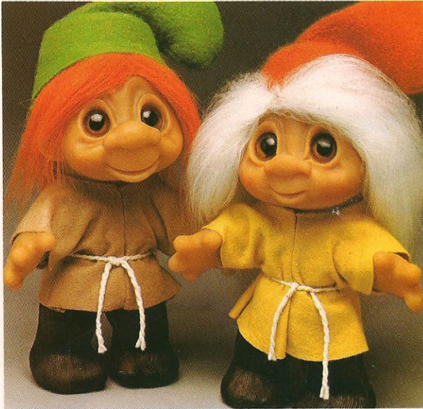
144 8" These two are the wise and gentle ones of the lot. They offer advice, kind words and make peanut butter and jelly sandwiches when you're hungry. (L-R 1441, 1442)